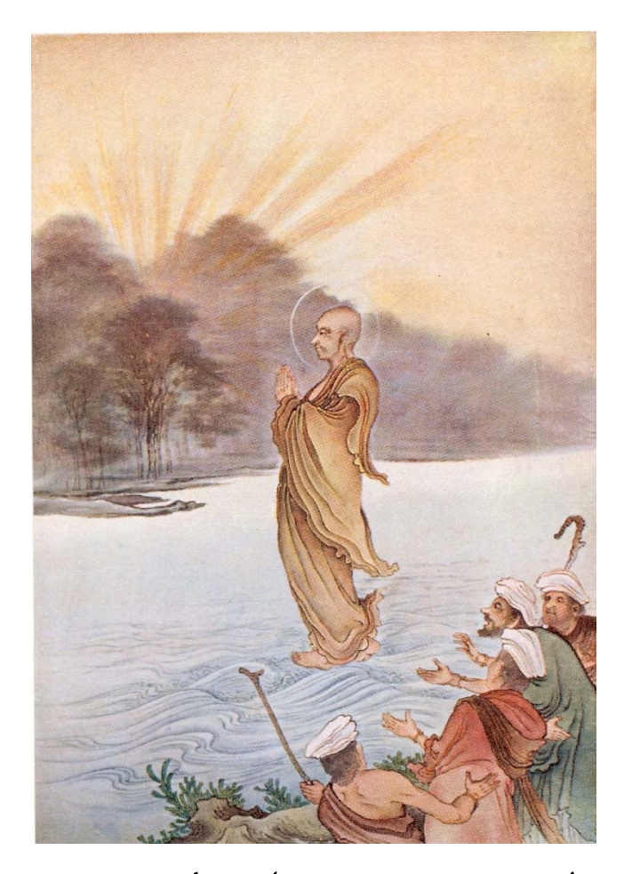
A Proposed Book & Documentary Film

The Gospel of Jesus Christ Hidden in the Chinese Language